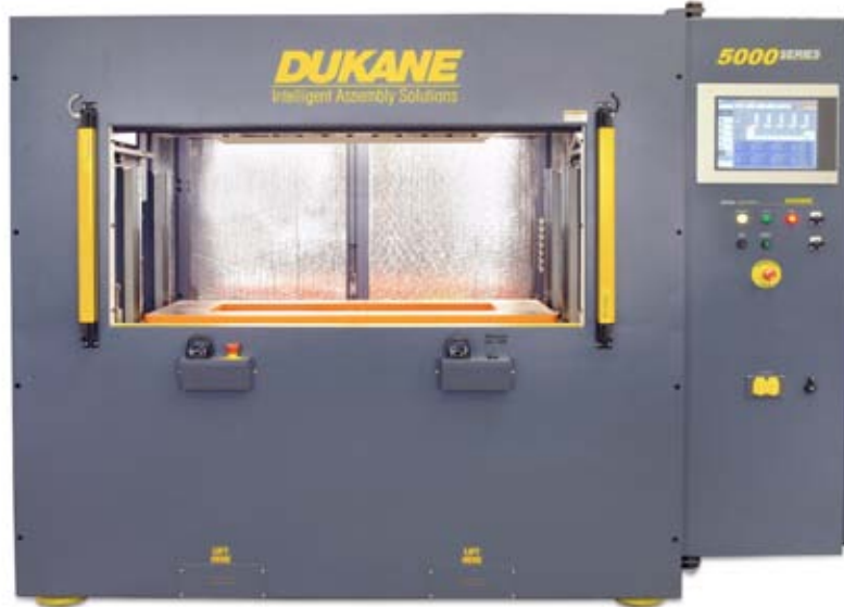
Table Size 72" (1800mm) by 18" (455mm)